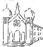
Synagogue Jewish Worship Place