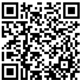
Zane RM -